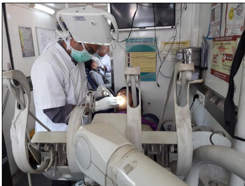
“ASHA HUMARI MUSKAAN” project