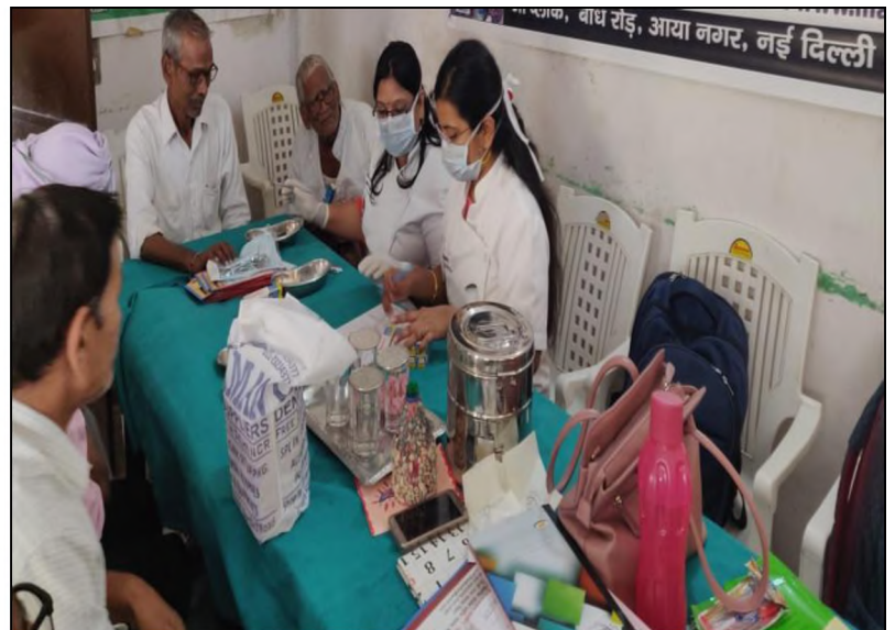
c) Dental screening of geriatric patients