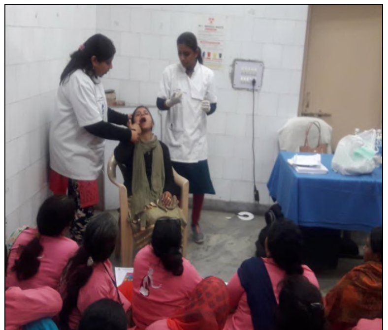
Learning by Doing