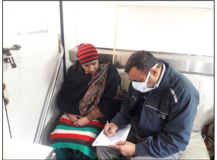
Patient entries in OPD cards