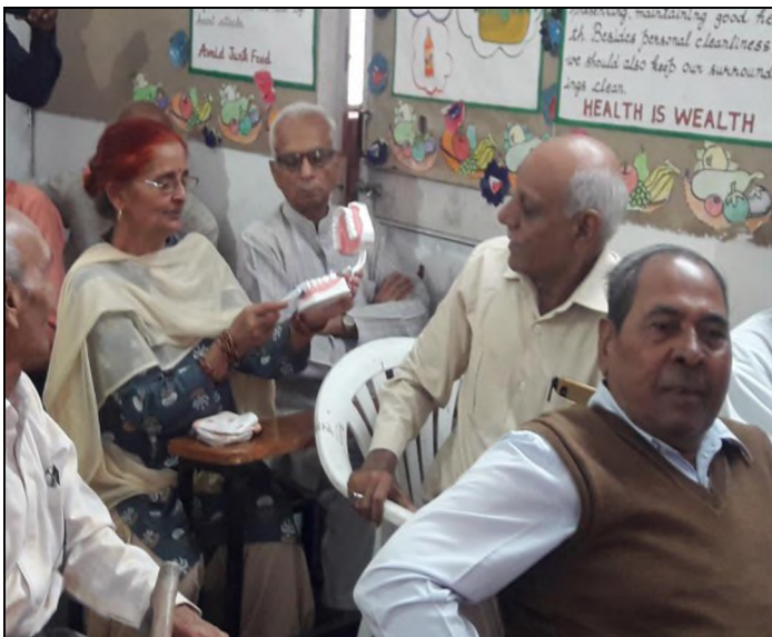
Learning by doing