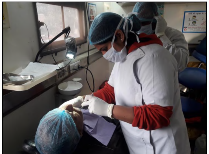
Dental Treatment of patients