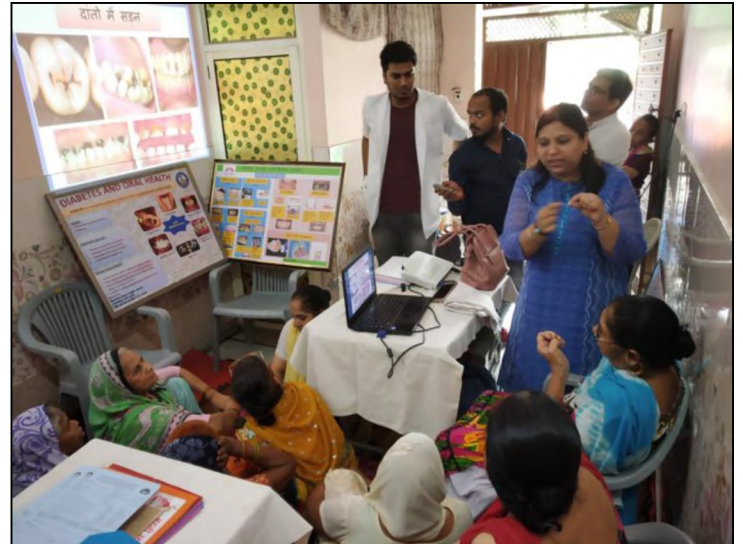
Conducting targeted health education sessions for geriatric population at old age homes/senior citizen's recreation centres