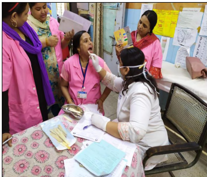
Dental screening of ASHA workers