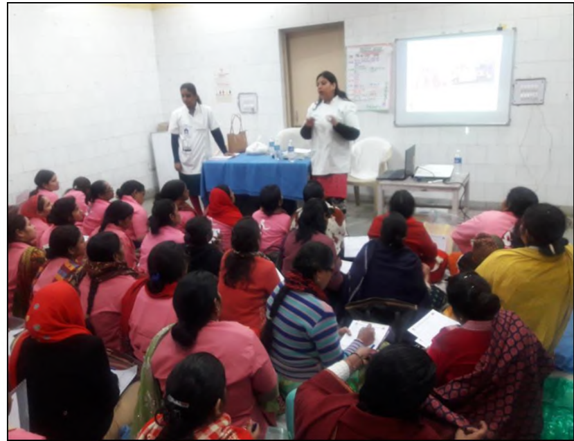
Capacity Building of ASHA workers through structured training sessions