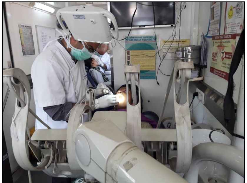
“ASHA HUMARI MUSKAAN” project