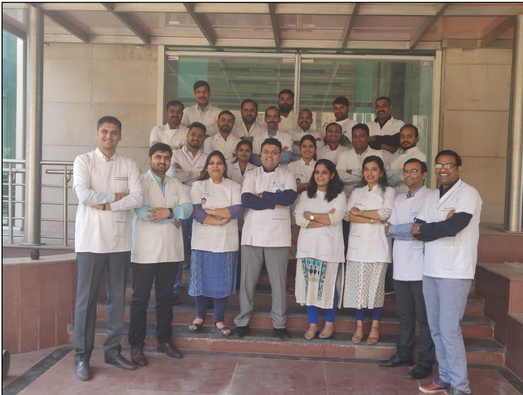
TEAM –Mobile Dental Clinic Project