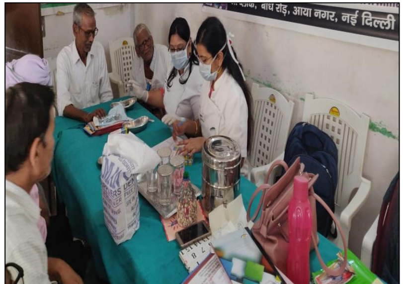
c) Dental screening of geriatric patients