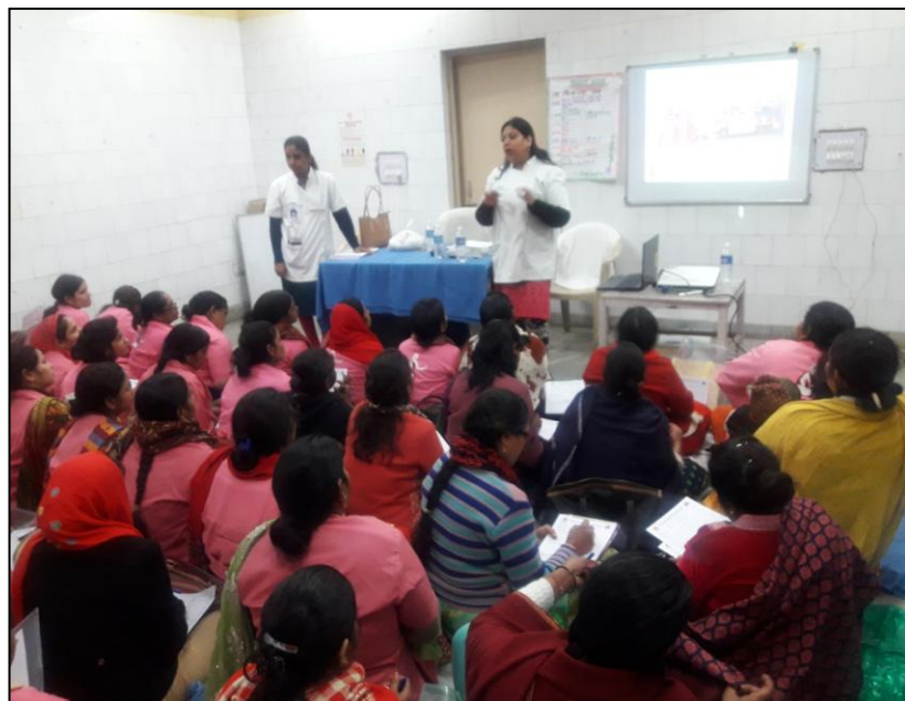
Capacity Building of ASHA workers through structured training sessions