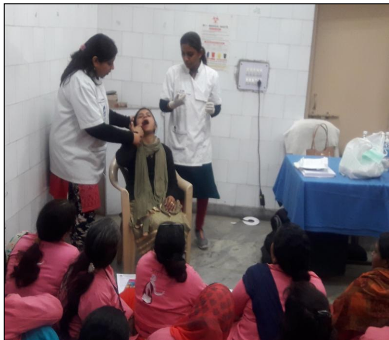
Learning by Doing