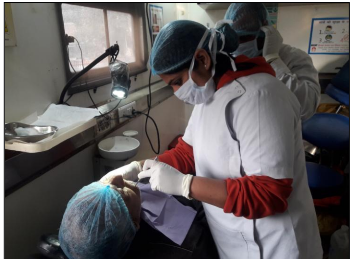
Dental Treatment of patients