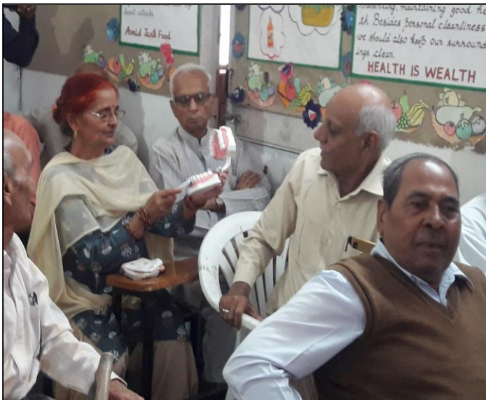
Learning by doing