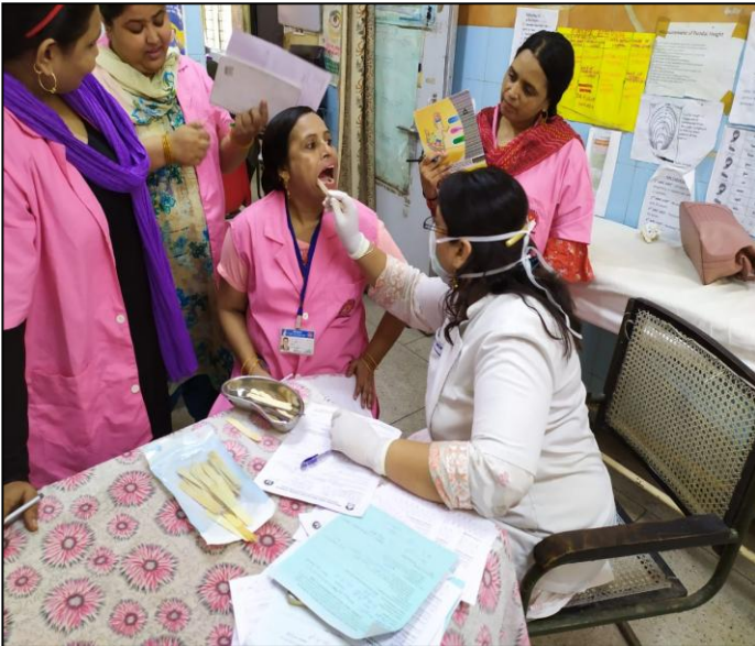
Dental screening of ASHA workers