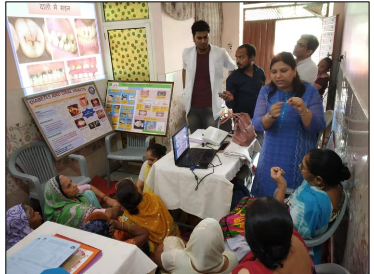
Conducting targeted health education sessions for geriatric population at old age homes/senior citizen's recreation centres