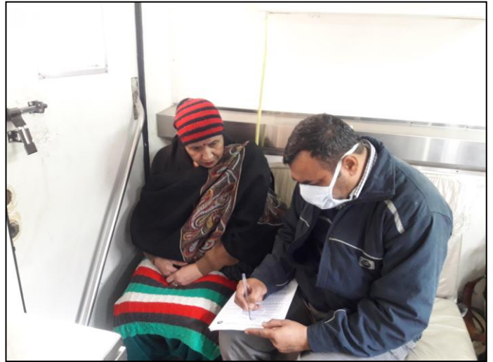
Patient entries in OPD cards